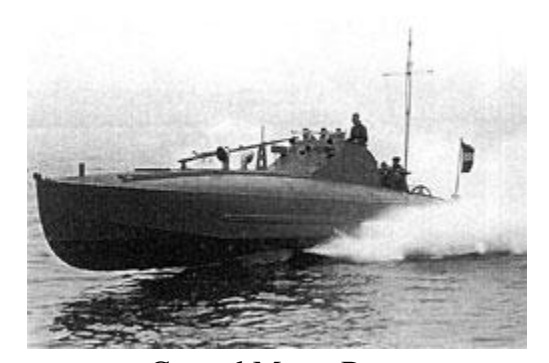
Coastal Motor Boat

In contrast with the slow, defensive nature of the Motor Launches were the Coastal Motor Boats, known as CMBs. In mid-1915 the ship building firm of Thornycroft submitted a plan for a small fast motor boat capable of carrying a torpedo. Three naval officers were seconded to Thornycrofts to assist in developing the design which had to be as light as possible, no more than 30 foot long, capable of being carried in davits on a light cruiser and with a speed of not less than 30 knots.