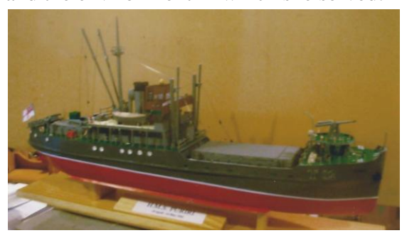
HMS Puriri model

Following the ceremony everyone returned to Whangarei RSA where a light lunch was provided. A model of HMS Puriri was on display with a book about Puriri and the environment in which she served.