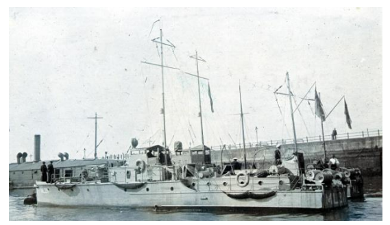
ELCO motor launches

The British yards were at full capacity and American legislation prohibited supplying arms to Britain or Germany. However, they could help Canada. Canada ordered 50 small craft from Elco fitted with a petrol engines and 3 pounder gun. This order was soon followed by a second order for 500 launches. Meanwhile, several ships were converted to carry the boats to Britain.