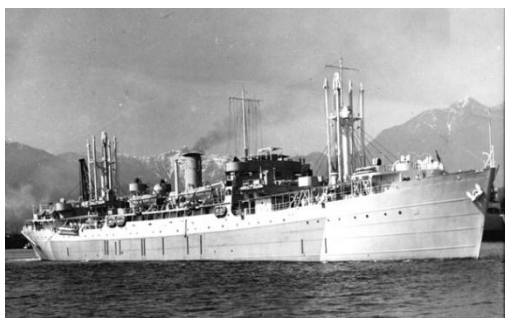
S S Algonquin Park

After the Algonquin Park was sold to Aviation & Shipping Co the funnel was repainted and the coal charter about Africa was terminated.